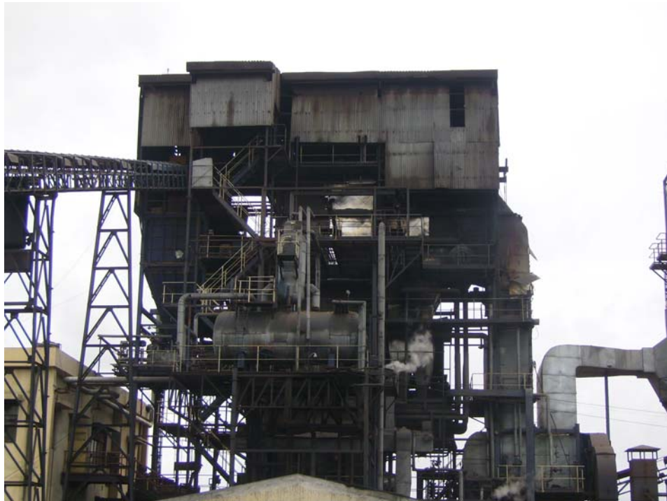
Malavalli Power Plant