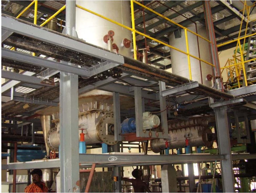
BERI Gasification Power [Top], Control Panel in Power station [Bottom]