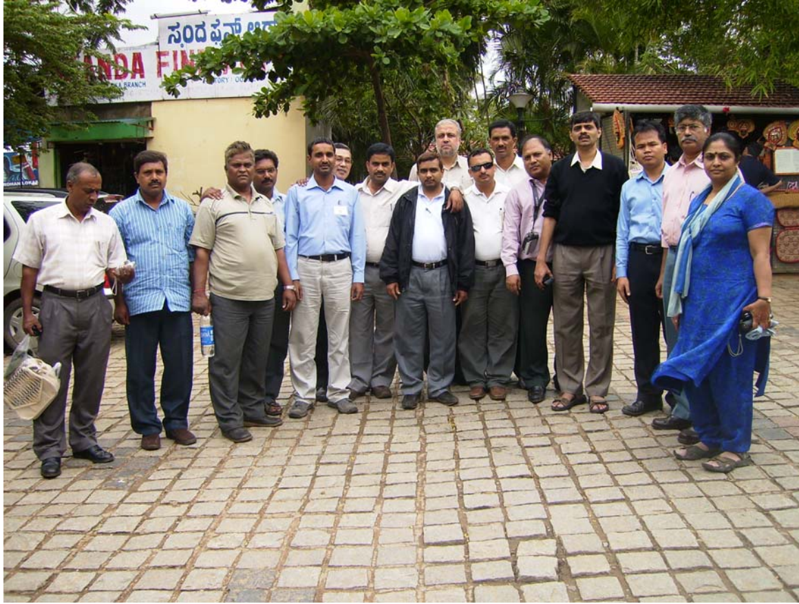
Photograph of the participants with the CGPL team