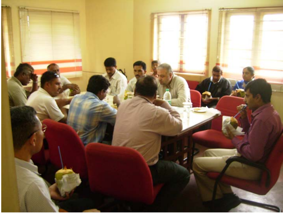
Discussion with Plant Manager