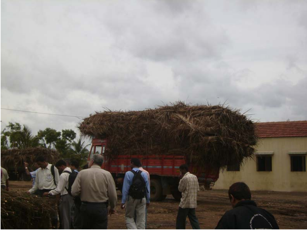
Coconut Fronds used as fuel